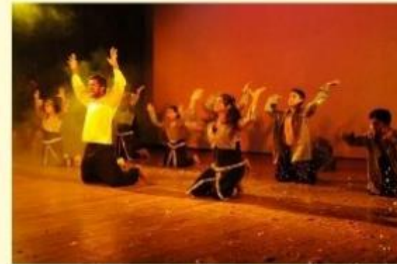
Gandharva Dance Academy