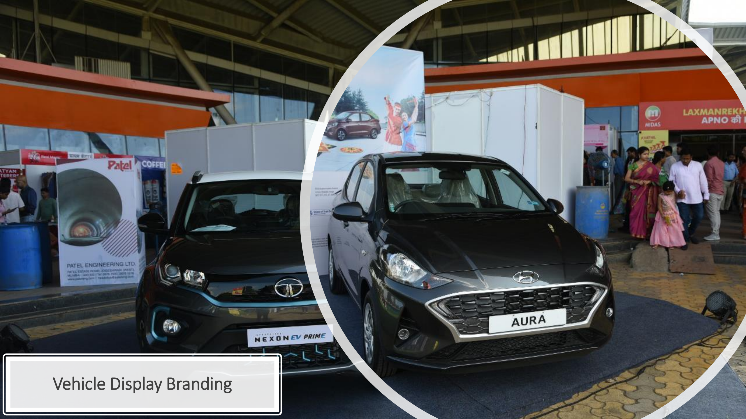
Vehicle Display Branding