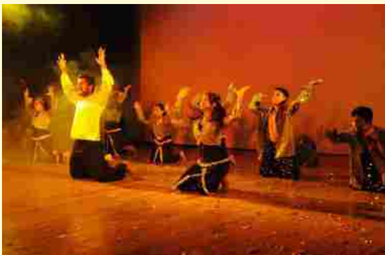
Gandharva Dance Academy