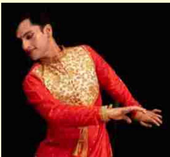
Kalamoksha Academy of Performing Arts